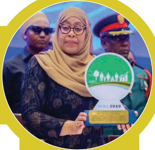
H.E. Dr Samia Suluhu Hassan President of United Republic of Tanzania officially launching Dira 2050 in July 2025